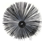
Brushes of 0,6/0,9mm polypropylene